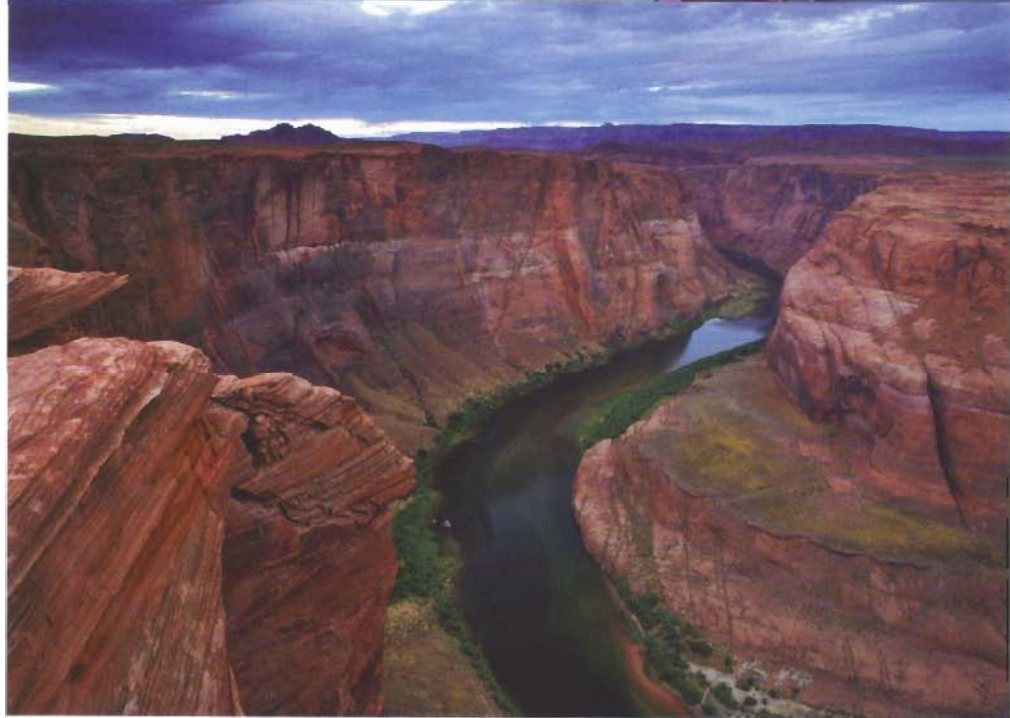
Left, right