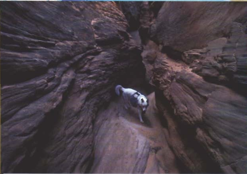
The author and his dog Altai on the river (top and far left).