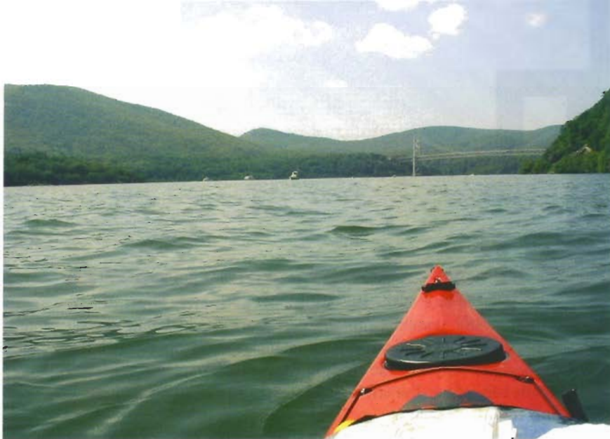
Above: The Hudson River Watertrail Association organizes many formal and informal events, one of which, the Albany-to-Manhattan Great Hudson River Paddle, includes views of the Bear Mountain Bridge (looking north).

the YCC kayaking tradition, although with a recreational focus rather than a competitive one. The boathouse is an unassuming building with dark rooms made of rough-hewn wood. The walls are adorned with old photographs, plaques and banners, and numerous trophies sit in cases behind dusty glass—historic memorabilia dating as far back as the 1890s. On the floor, aging red-and-white chipped paint still shows evidence of the old YCC logo—a dolphin holding a paddle—and a dolphin skull hangs on the wall opposite an engraved wooden sign with the motto “The Club Comes First.”